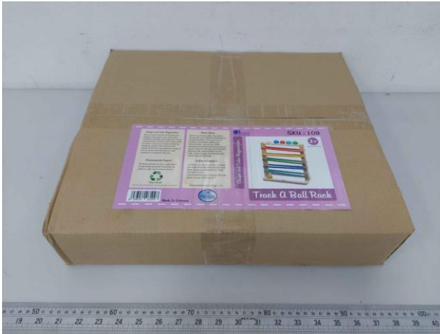
Photo of submitted sample